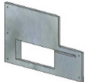
PART #100-755G CROSS CUT, EAST