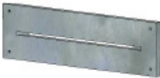
PART #100-755D RIP SAW, MIDDLE